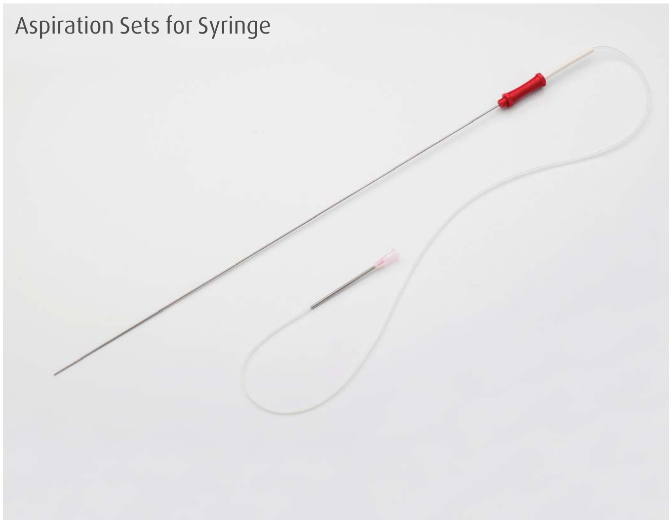
Triple cut needle tip Echo marked tip